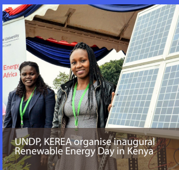
UNDP, KERA organise inaugural Renewable Energy Day in Kenya