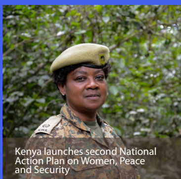
Kenya launches second National Action Plan on Women, Peace and Security