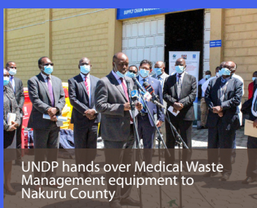
UNDP hands over Medical Waste Management equipment to Nakuru County